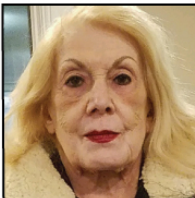
March 8 54 days after fall.