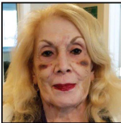
February 13 31 days after fall.