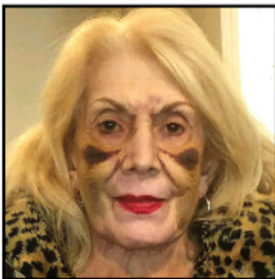
February 7 24 days after fall.