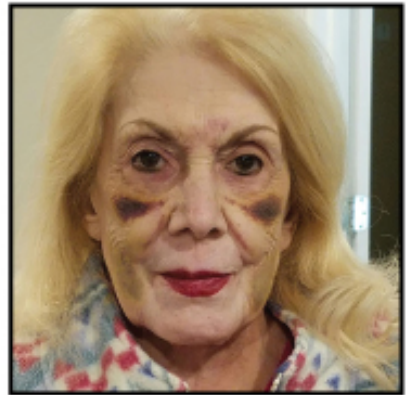
January 30 17 days after fall.